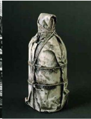
Christo – Wrapped Bottle